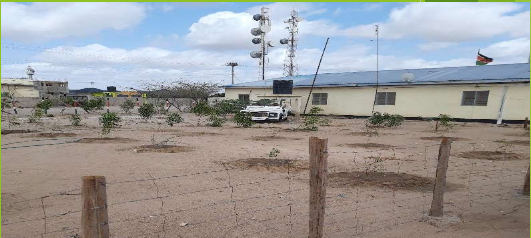
Woodlot (Neem trees) established at Modogashe Administration office compound Lagdera Sub County.