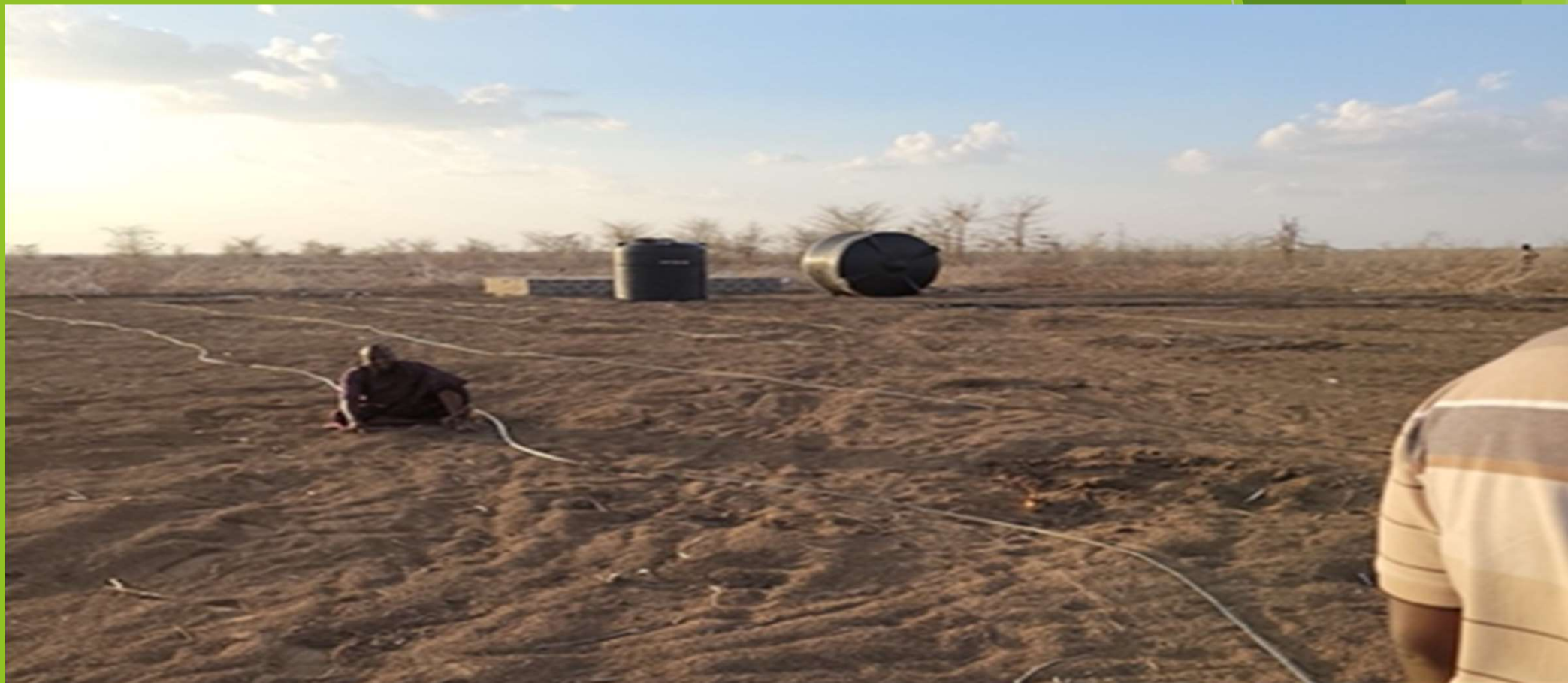
Land reclamation for irrigation Goreale, Lagdera