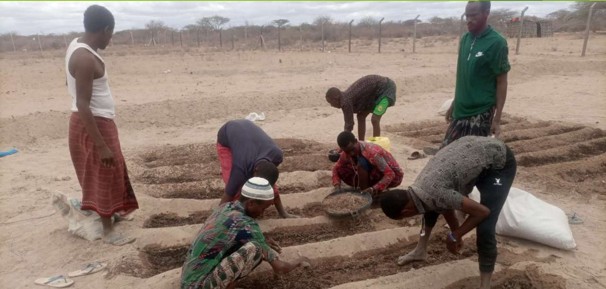
Water conservation structures for grass reseeding at Khumbi, Wajir South.