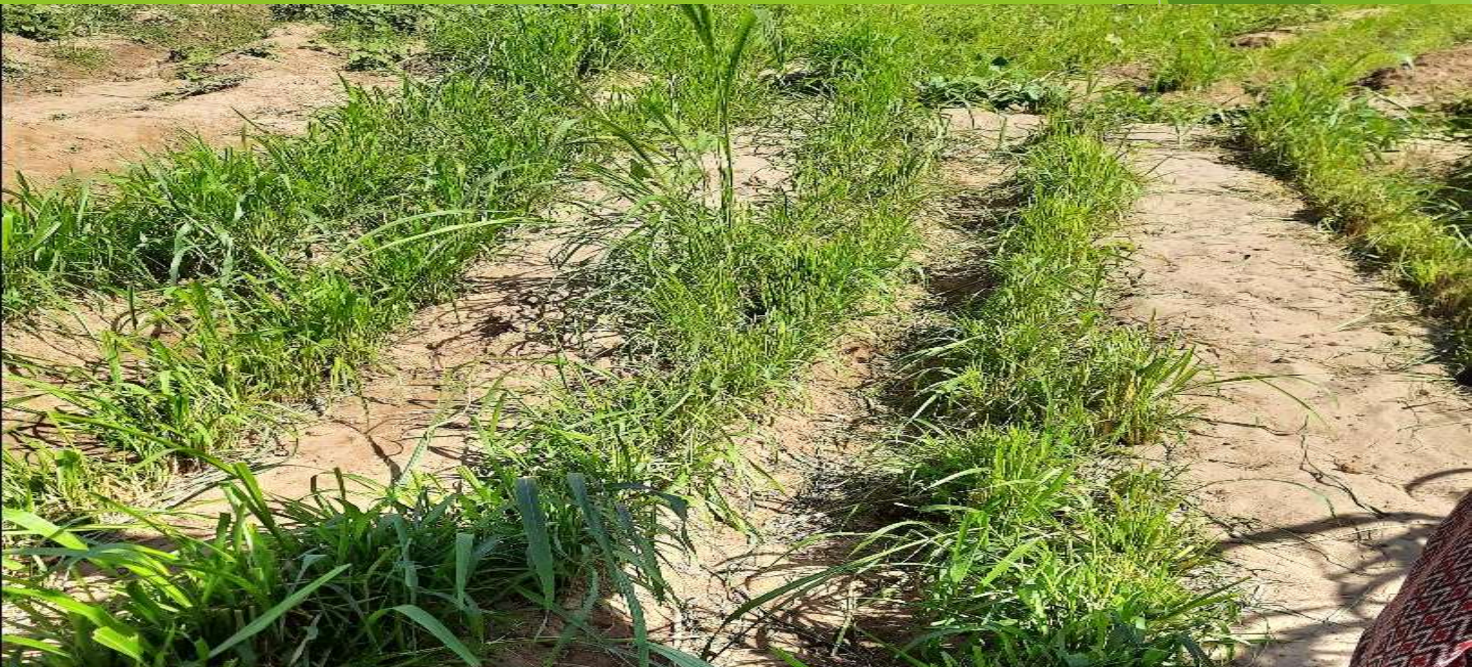
Grass reseeding and fodder development –Bura Village in Fafi Sub County