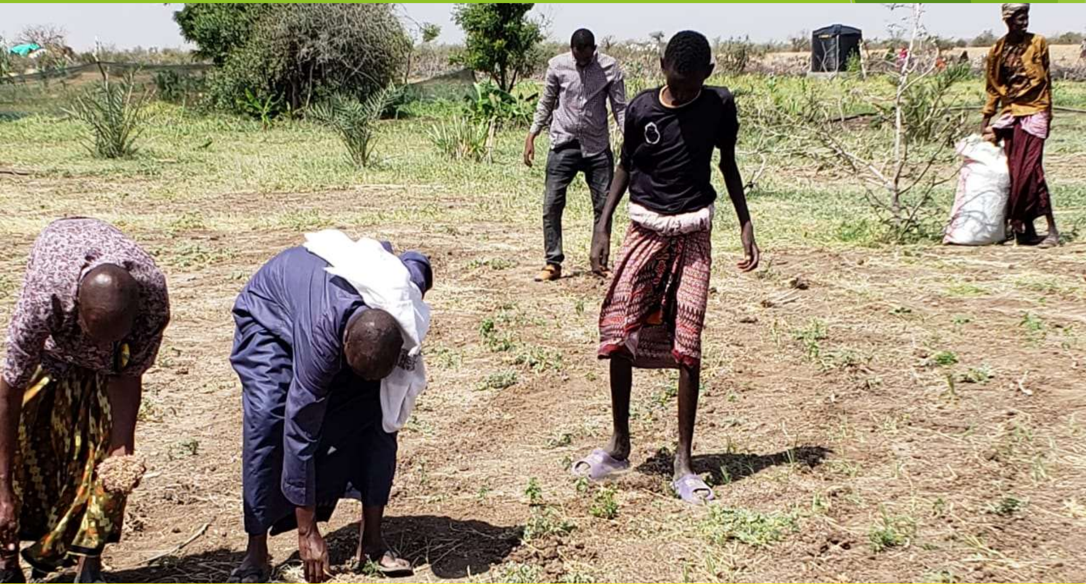
Grass reseeding in Alikune Community Farms Dadaab, Sub-County- Garissa County