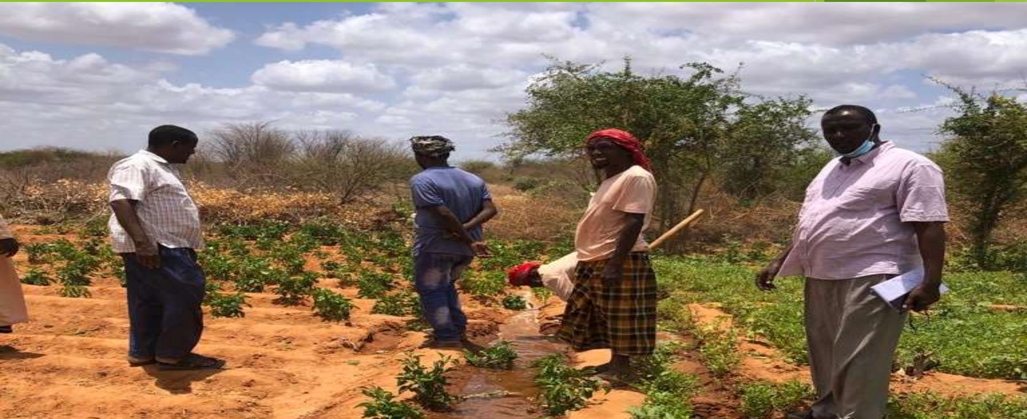
IFO farms in Dadaab growing capsicum, cowpeas & local vegetables