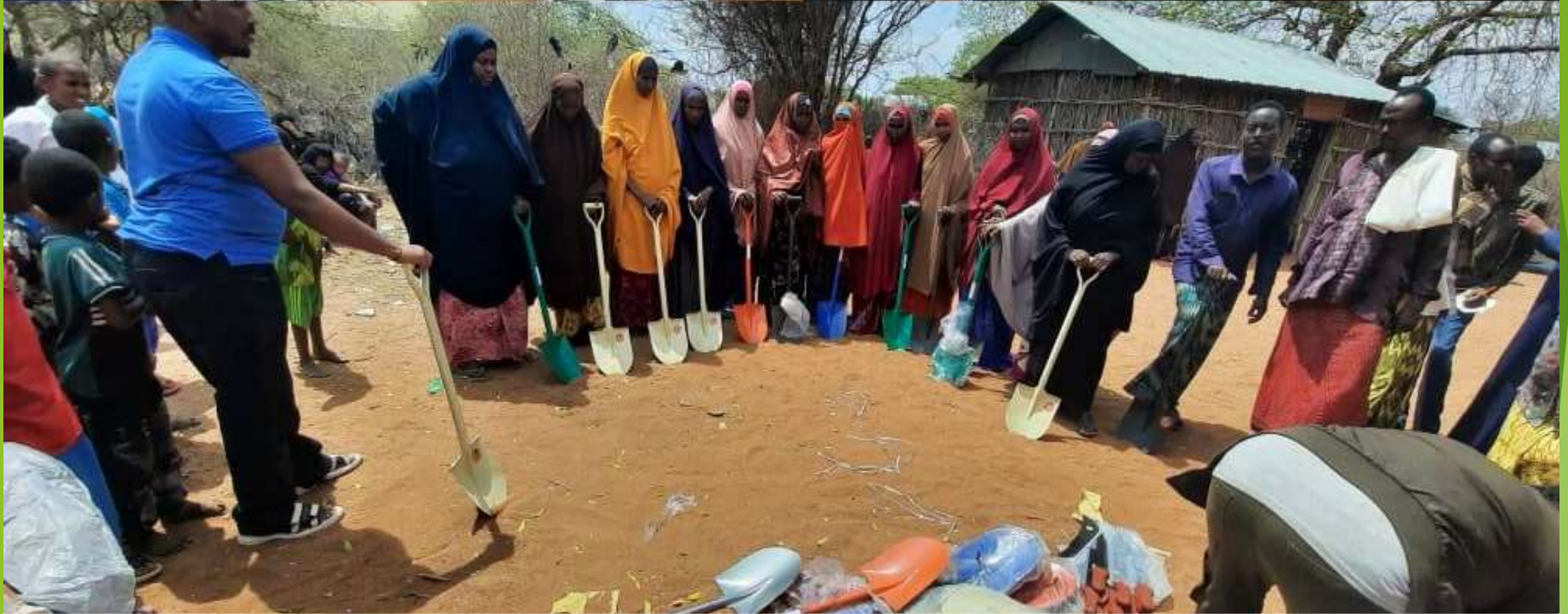
LIPW CPMC distributing working tools to one of the LIPW Working group in Kulan village, Dadaab