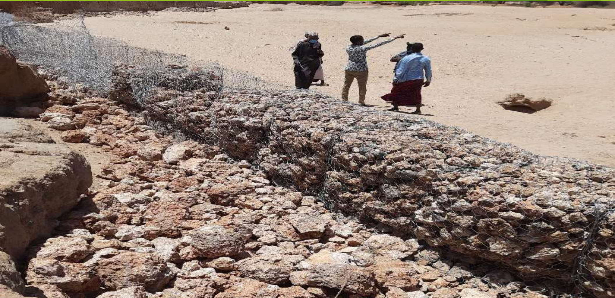
Soil and Water Conservation in Barkuke village Lagdera Sub County- flooding Control through construction of gabions.