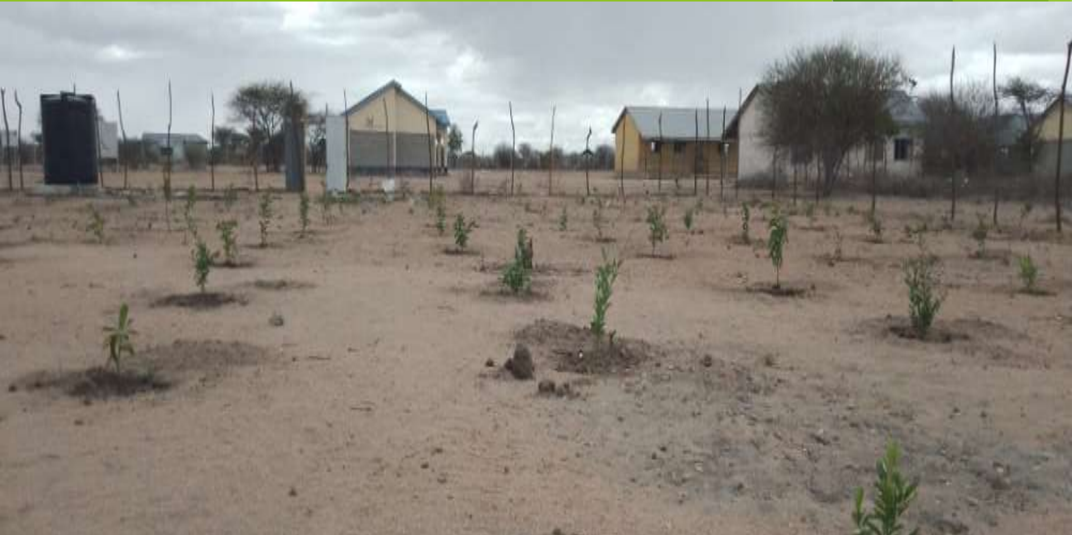
Tree planting in Abakaile primary school Dadaab, Sub County- Garissa County