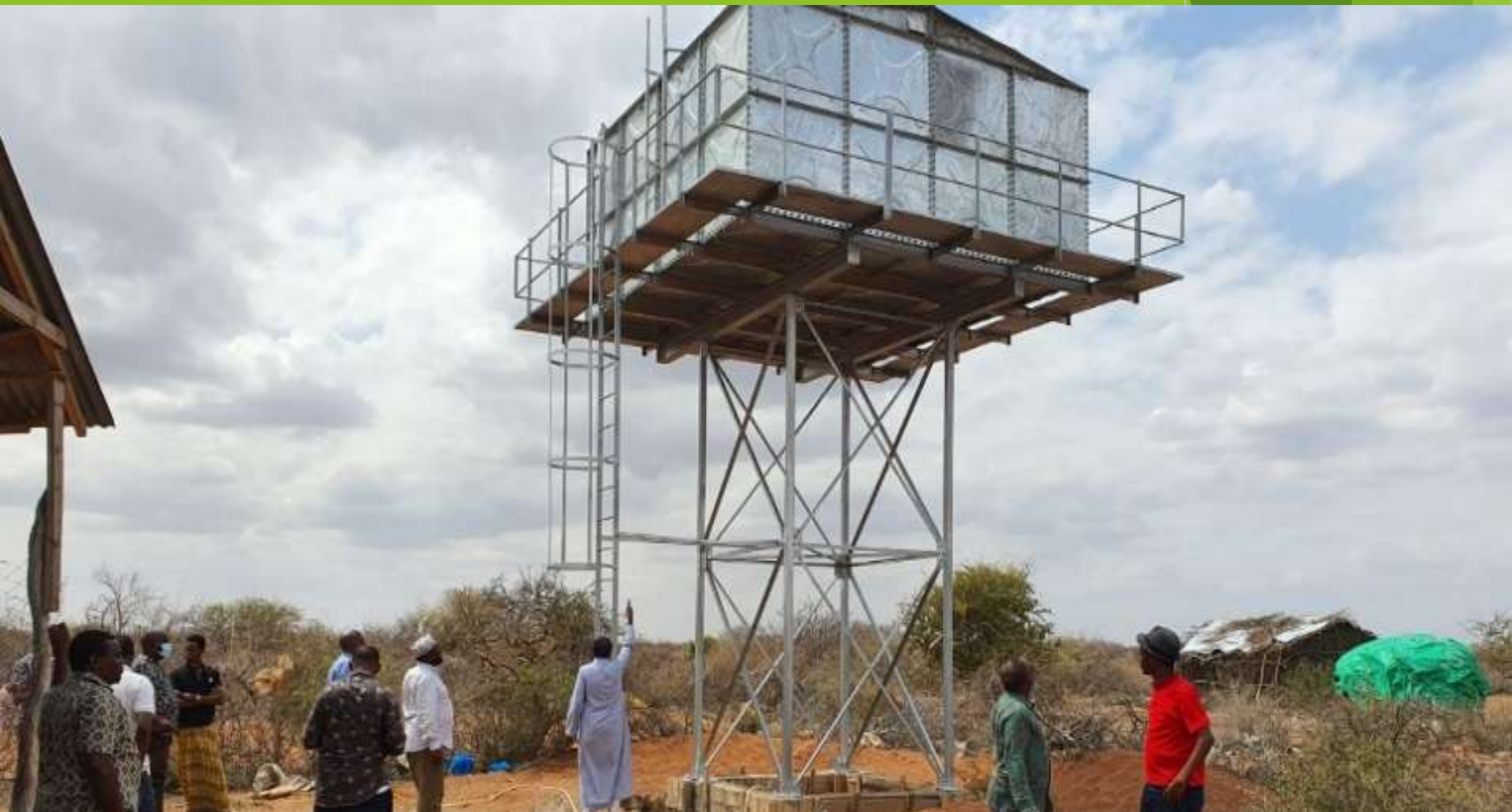
Elevated water tank at Midnimo village in Wajir South