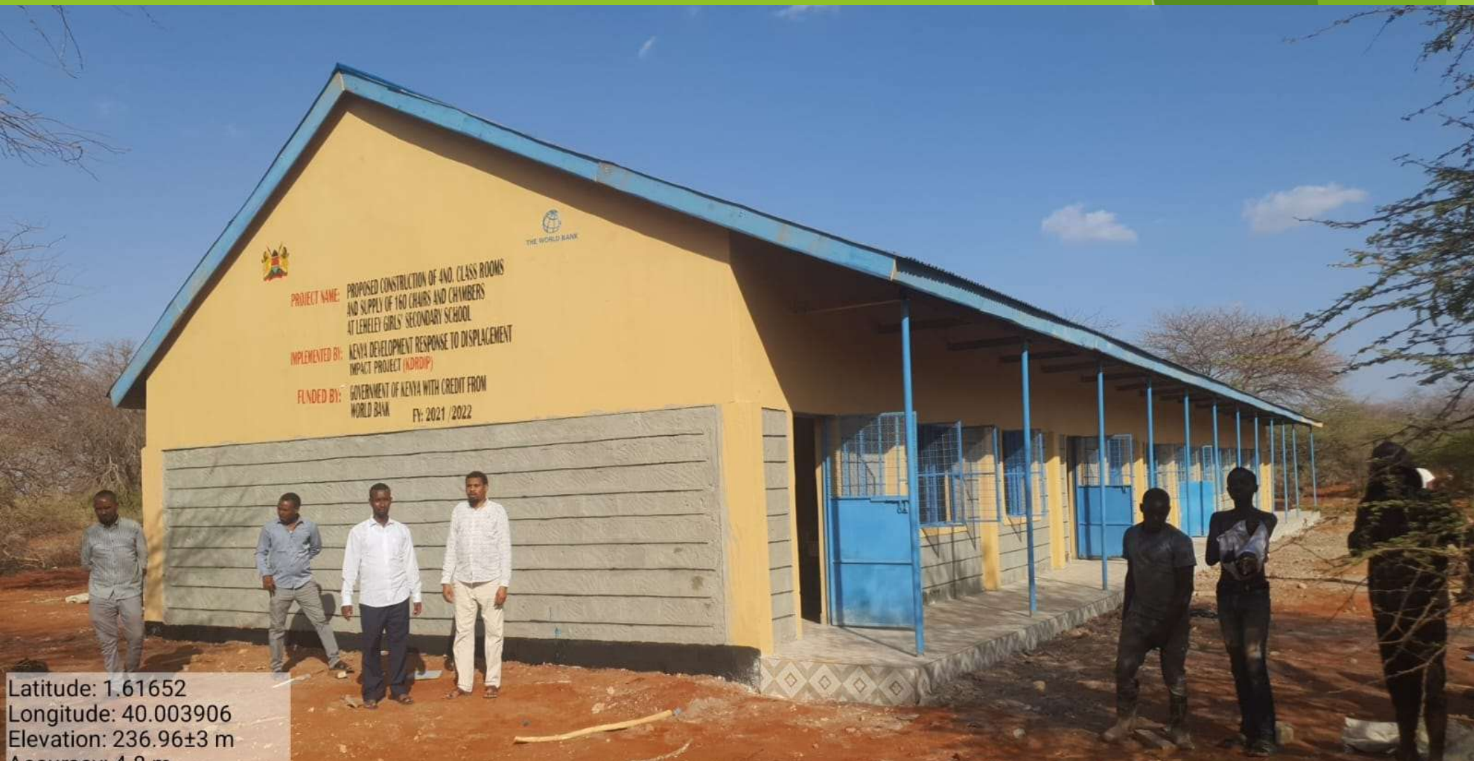
Four classrooms constructed at Leheley Girls Secondary School-Wajir South