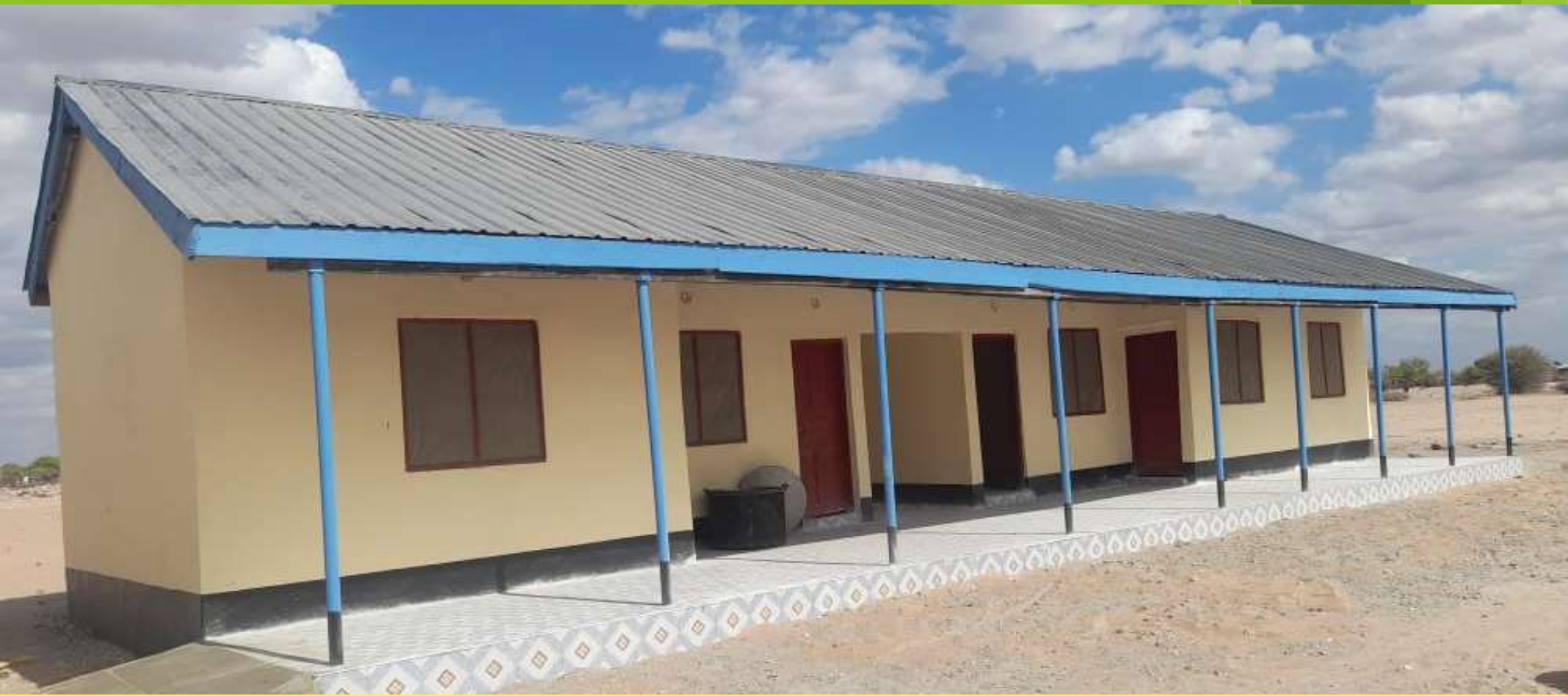
Constructed Burder Primary School Administration Block in Wajir