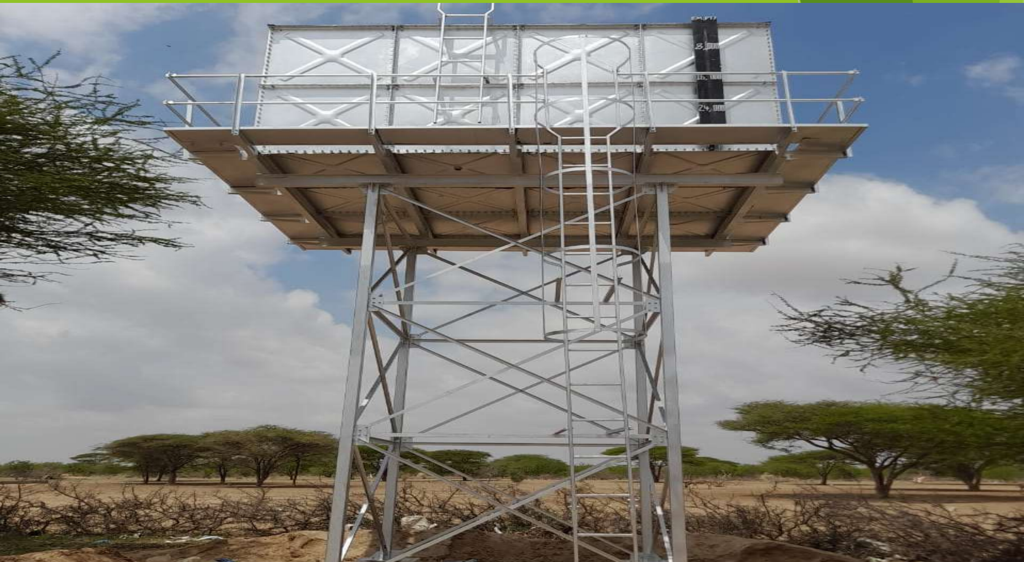
Completed elevated Steel water tank at Dalsan, Wajir South