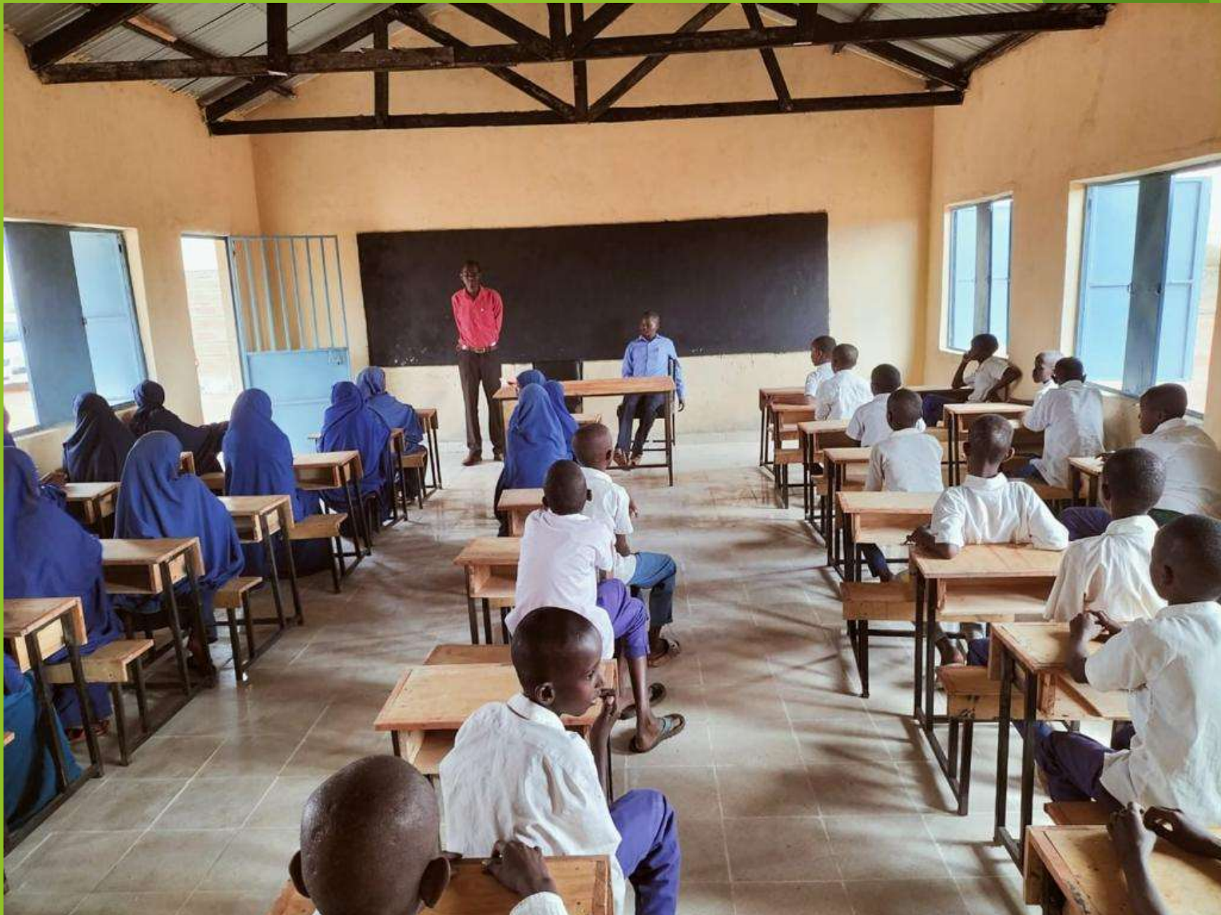
Constructed and equipped classroom at Salalma Primary School, Wair South