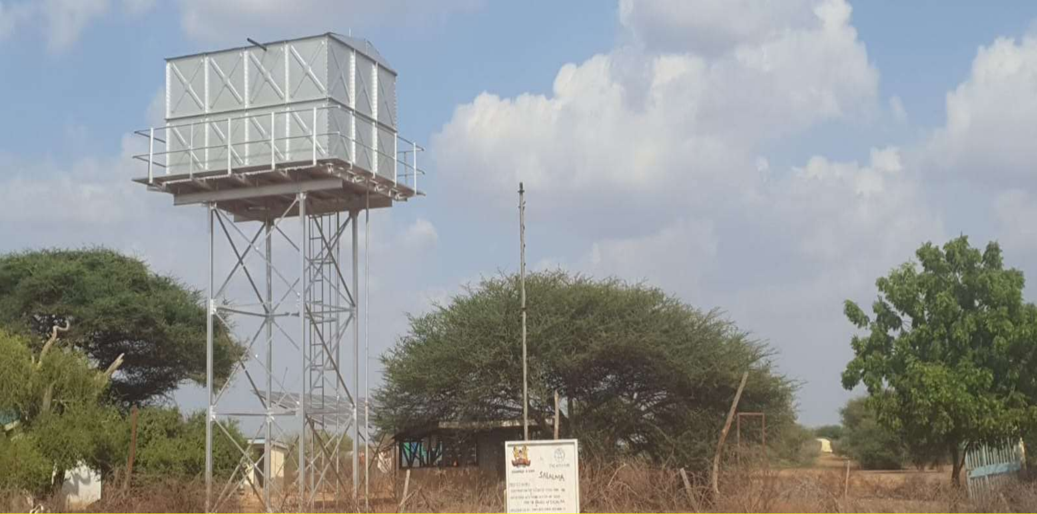
Completed and branded borehole at Salalma (including construction of 32M 3 elevated steel tank)