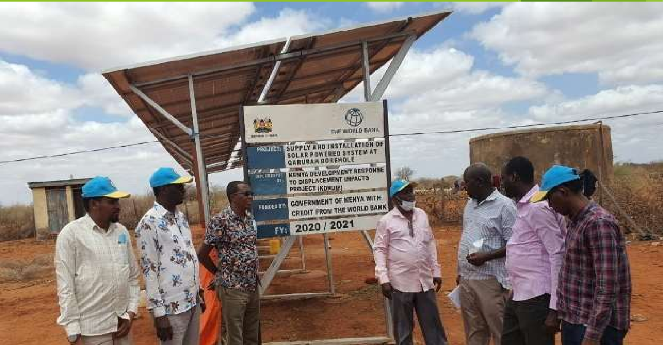
Solarized Qarurah Borehole in Diif Ward, Wajir South