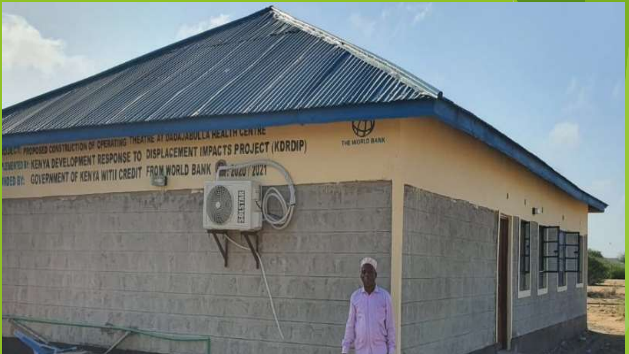
Operating theatre, constructed and equipped at Dadajabulla Health Centre