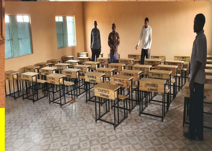
Before and after intervention at Kulaalay Primary in Wajir South