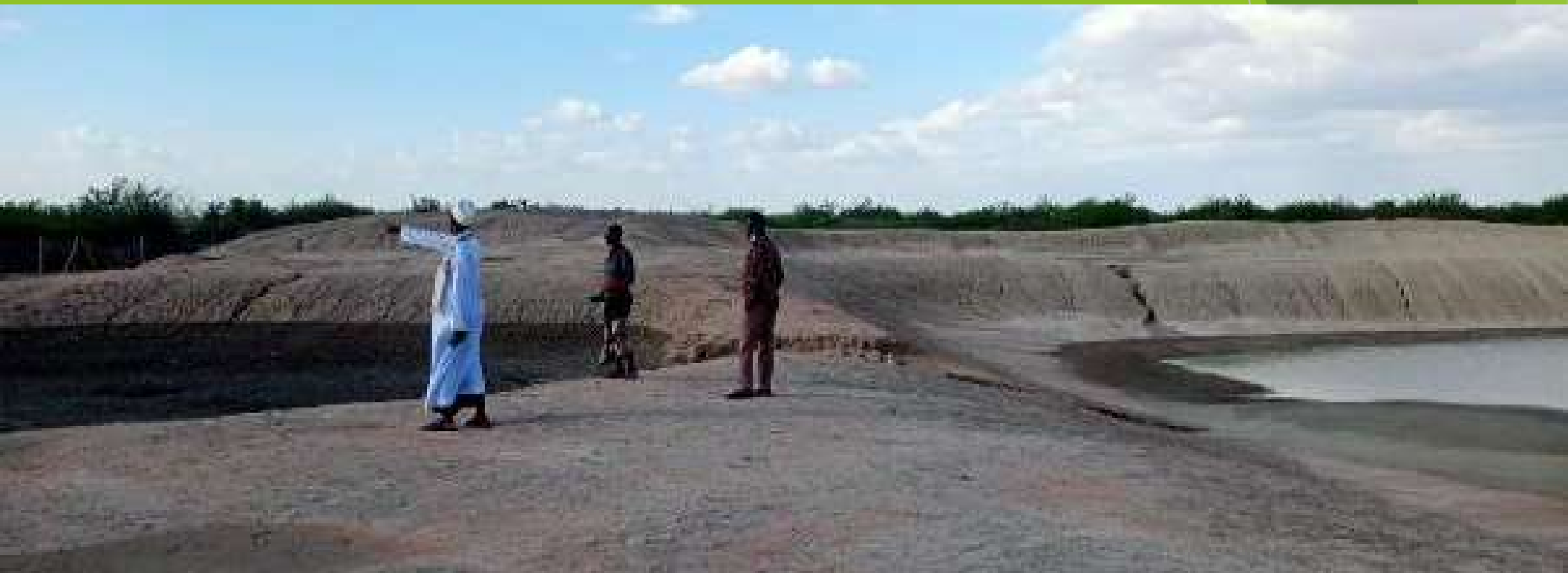
Waregader Water Pan in Abakore, Habaswein Ward Wajir