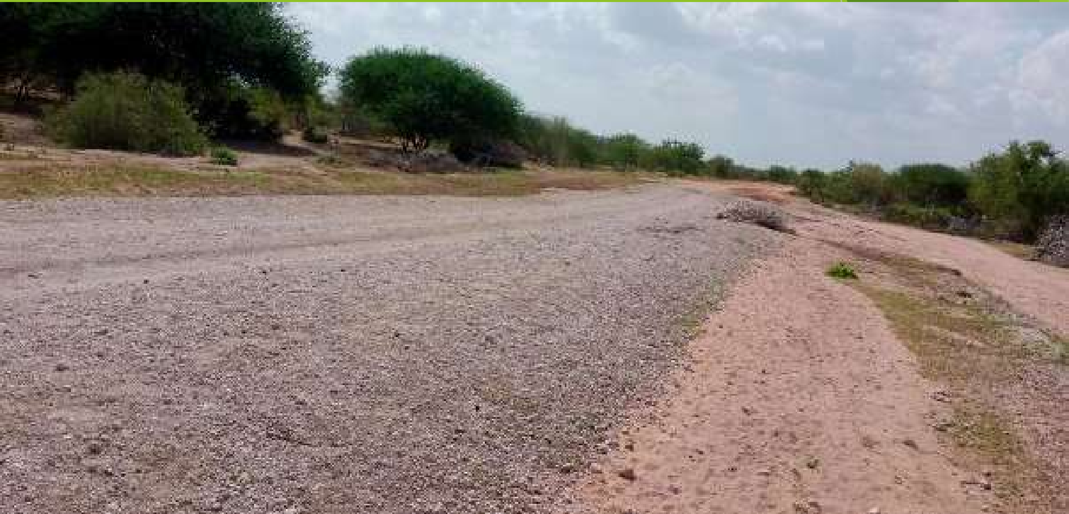
Gravelling and murraming of Alio Ismail road in Wajir South