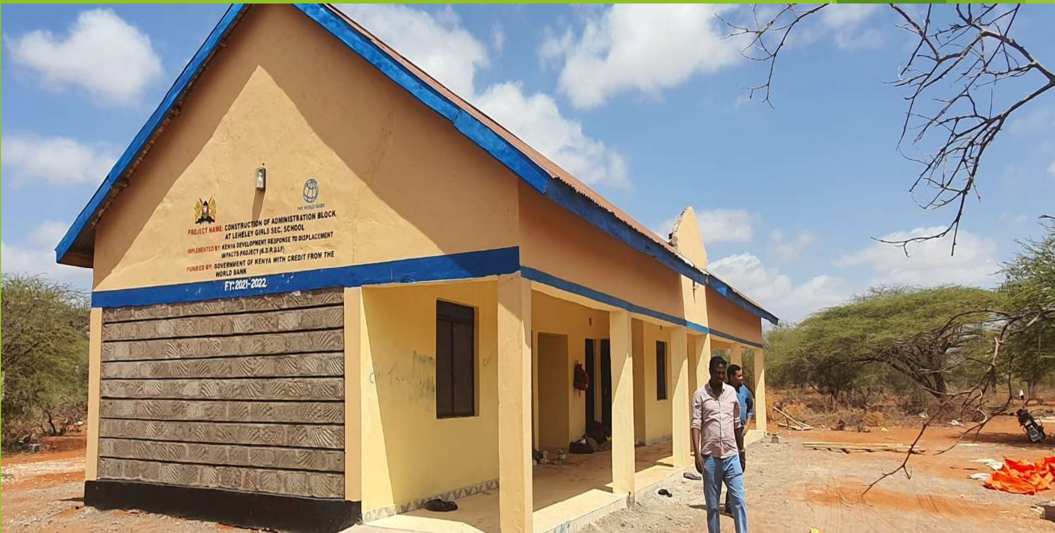
Completed Administration Block at Leheley Girls Secondary School-Wajir