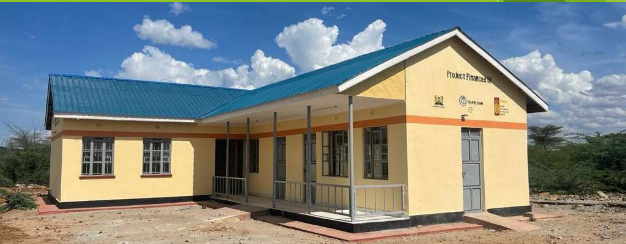
Constructed Maternity Wing in Kalobeyi Health facility