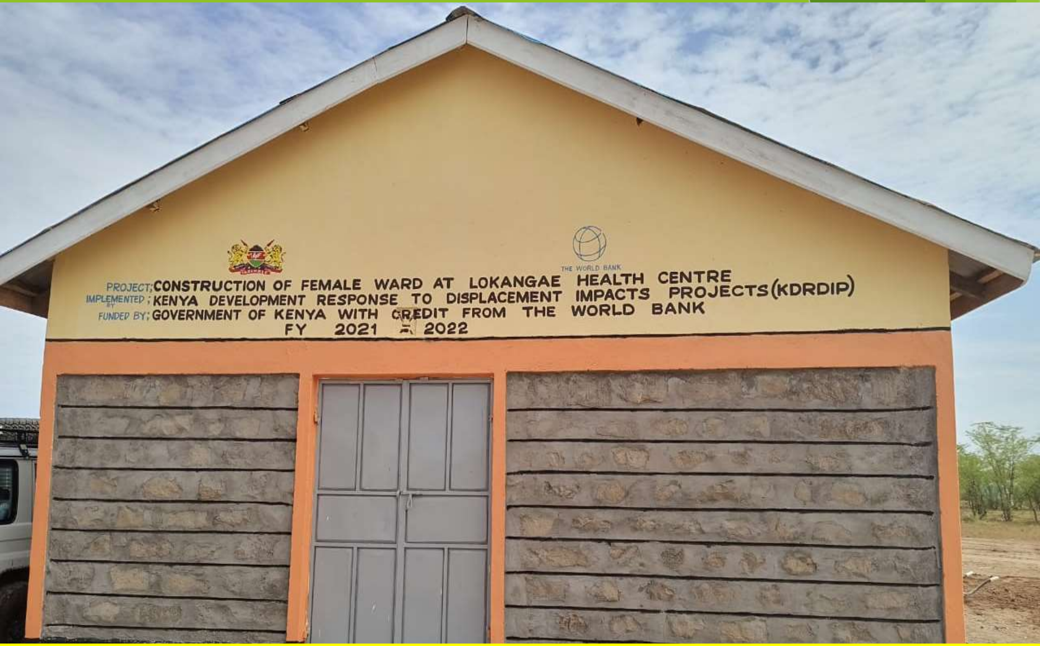
Female ward Constructed at Lokangae health Facility Turkana West