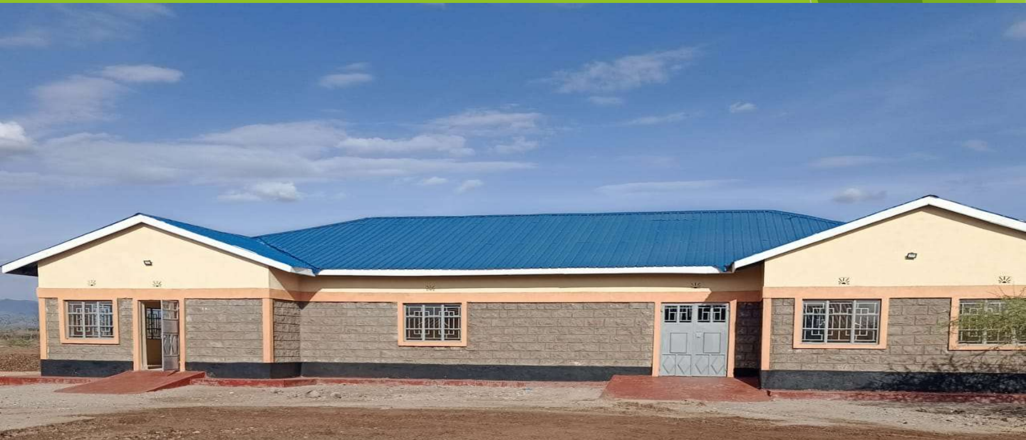
Constructed and equipped modern maternity ward at Kakuma sub county hospital