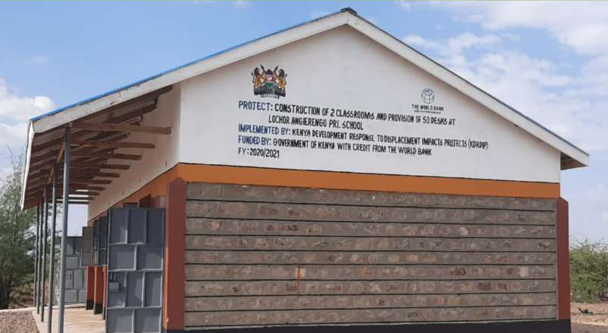
Two Classrooms Constructed at Locher -Angierengo Primary school, Turkana West