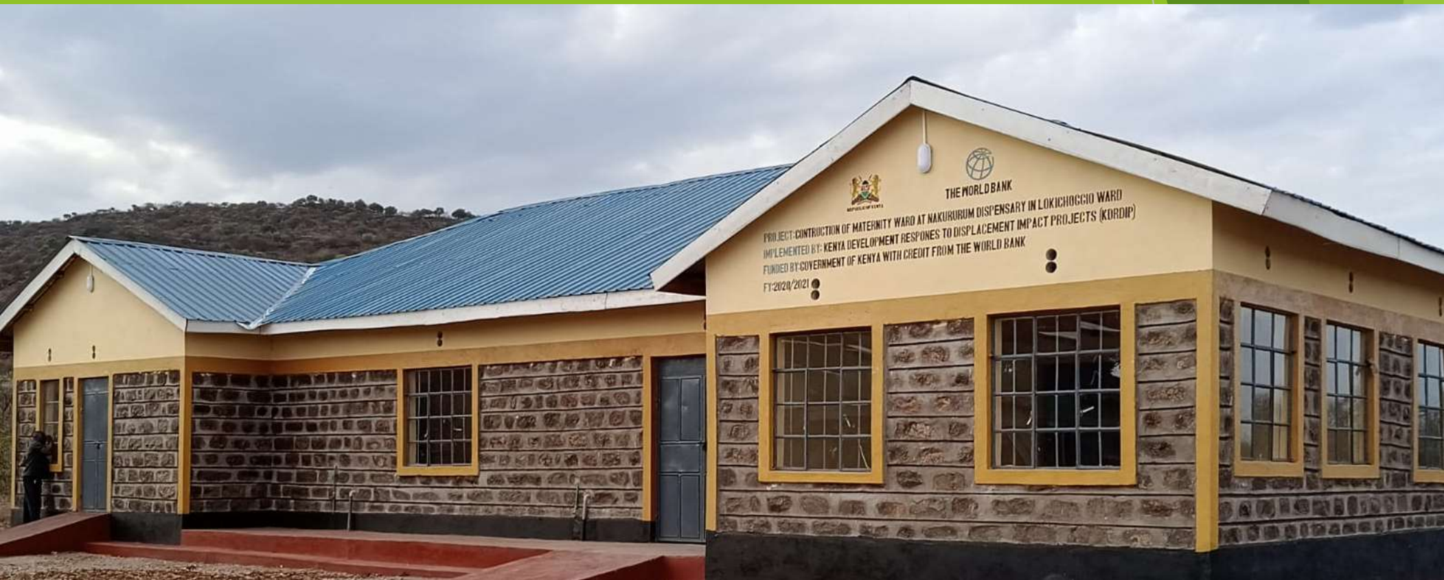
Nakururum Dispensary (Lokichogio Ward, Turkana West)