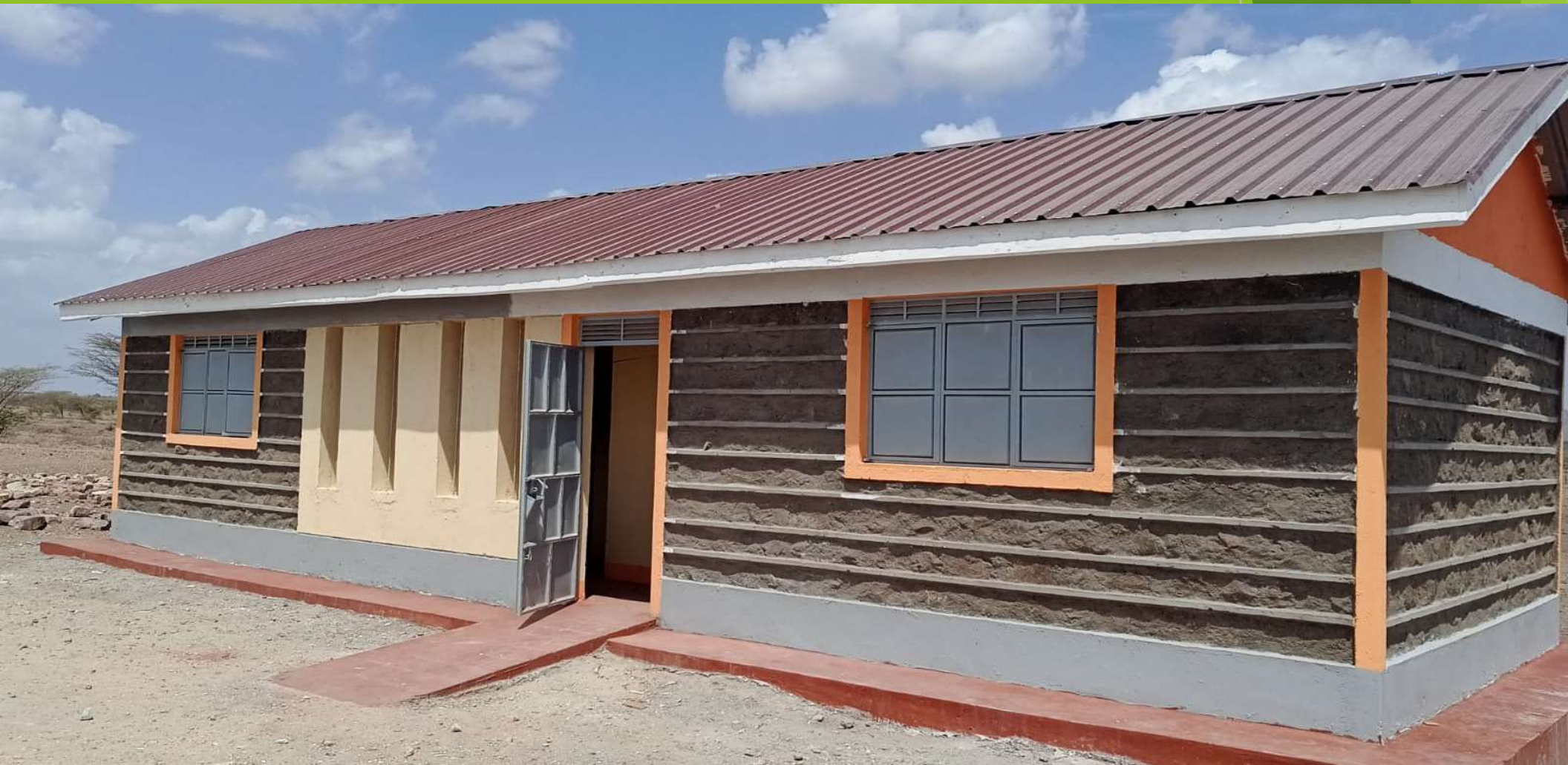
Teachers house at Losajait primary school