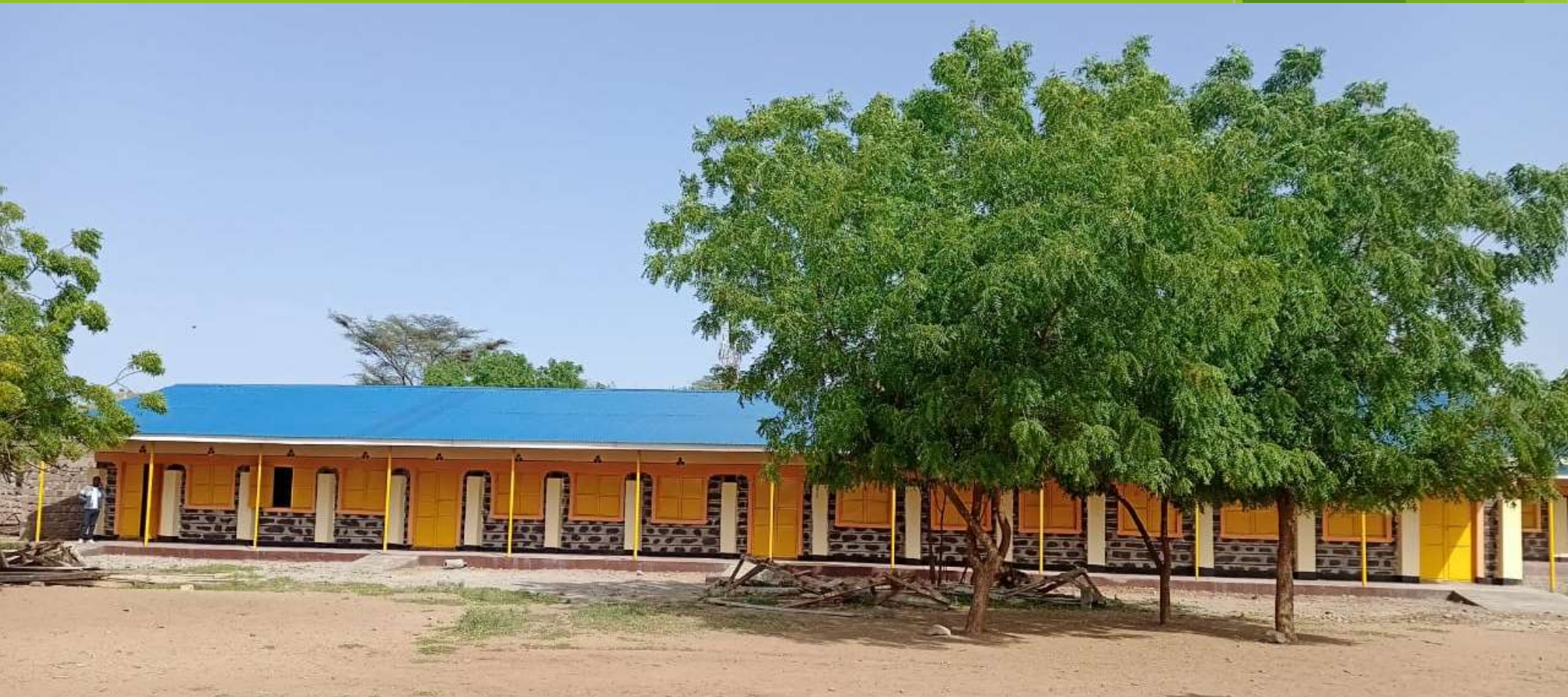
Four Classrooms constructed and equipped in Lokichoggio Mixed Primary school Turkana West