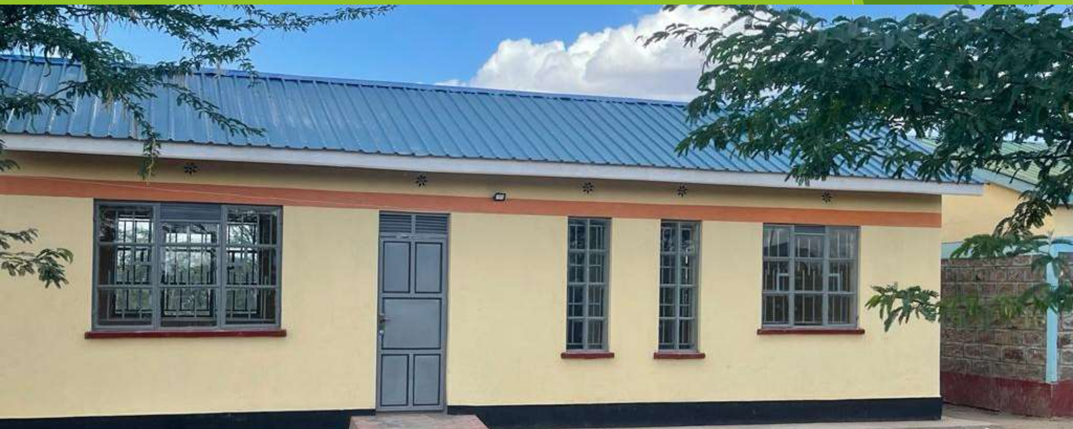
Construction of Kalobeyei health staffs Quarters houses