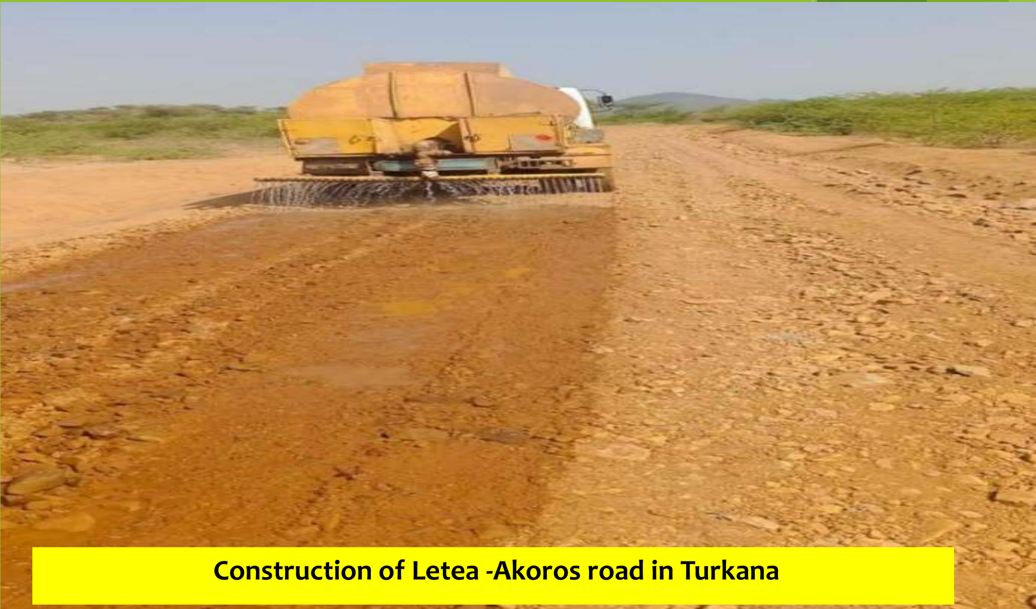
Construction of Letea -Akoros road in Turkana