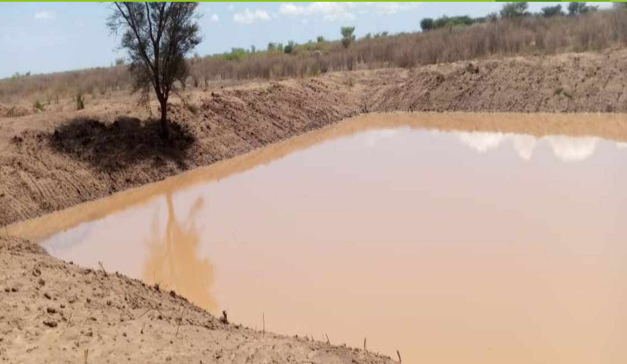
Desilted Kalopusia Water pan, Lopur Ward Turkana West