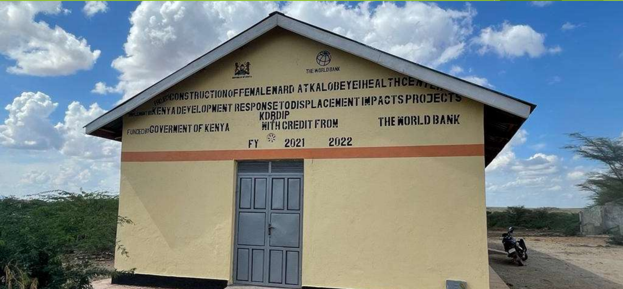
Completed Female ward at Kalobeyei health facility