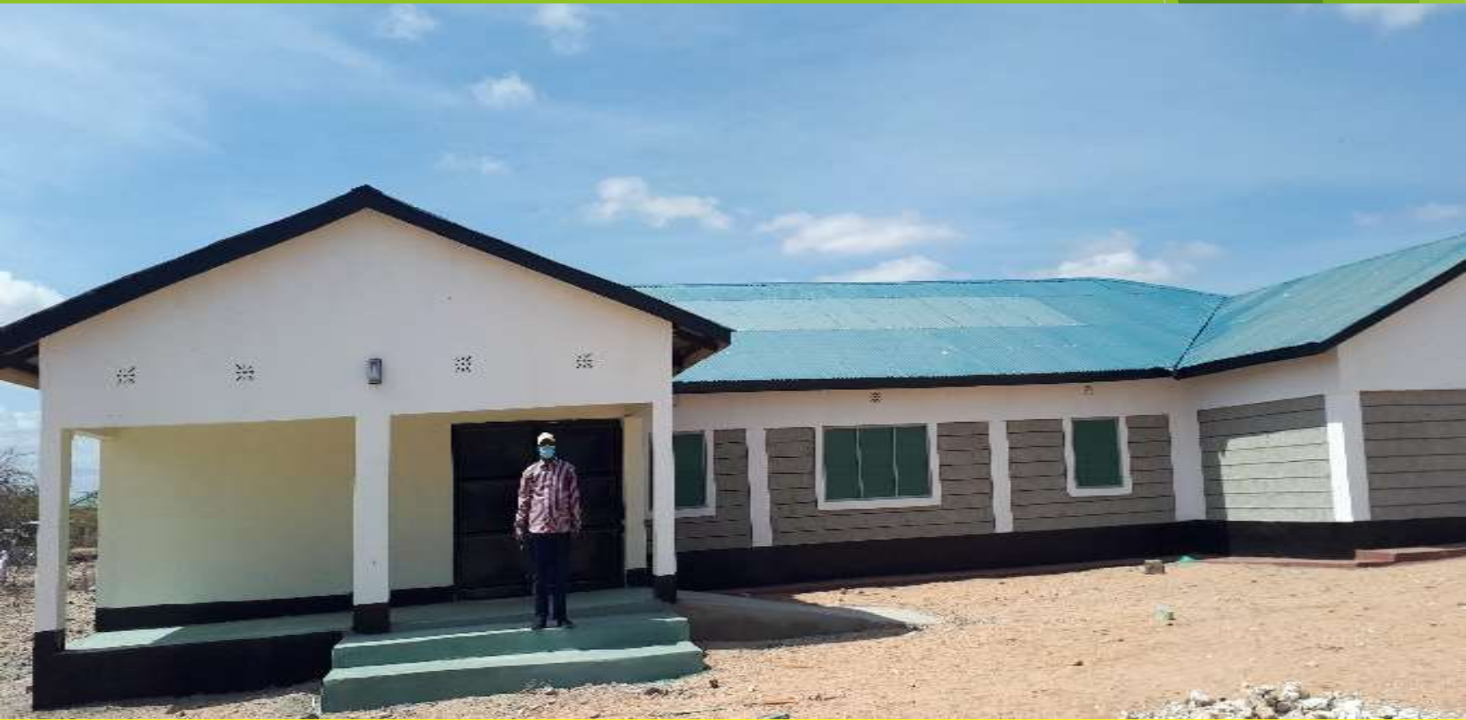
Completed and equipped Benane Maternity Unit in Lagdera sub-county