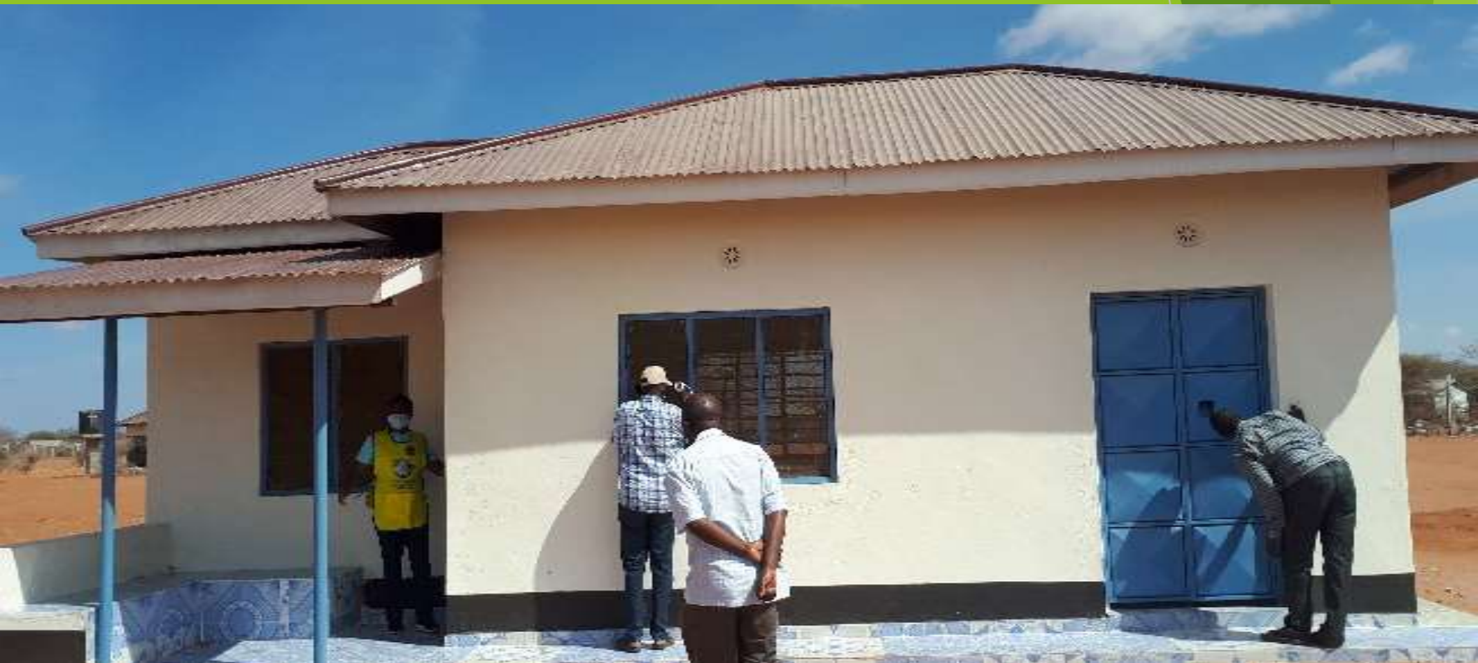
Constructed and equipped Dertu Laboartory in Daadab