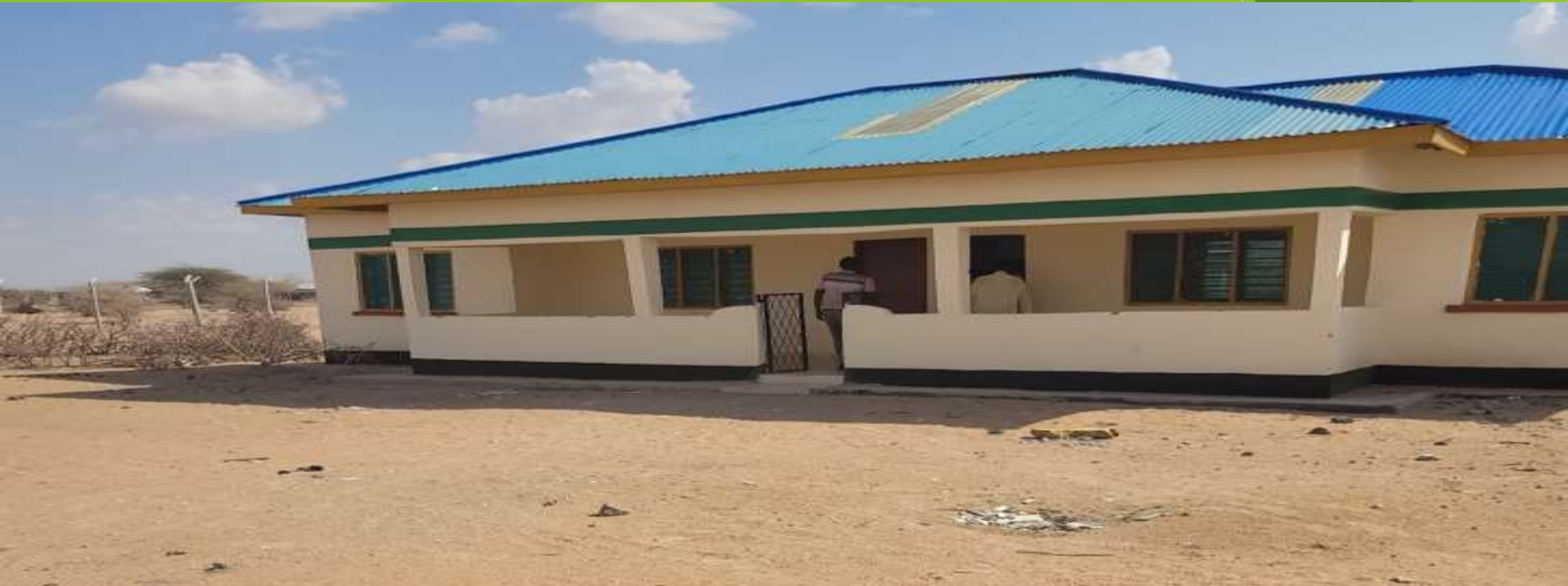
Construction of staff quarters Shanta Abak , Garissa