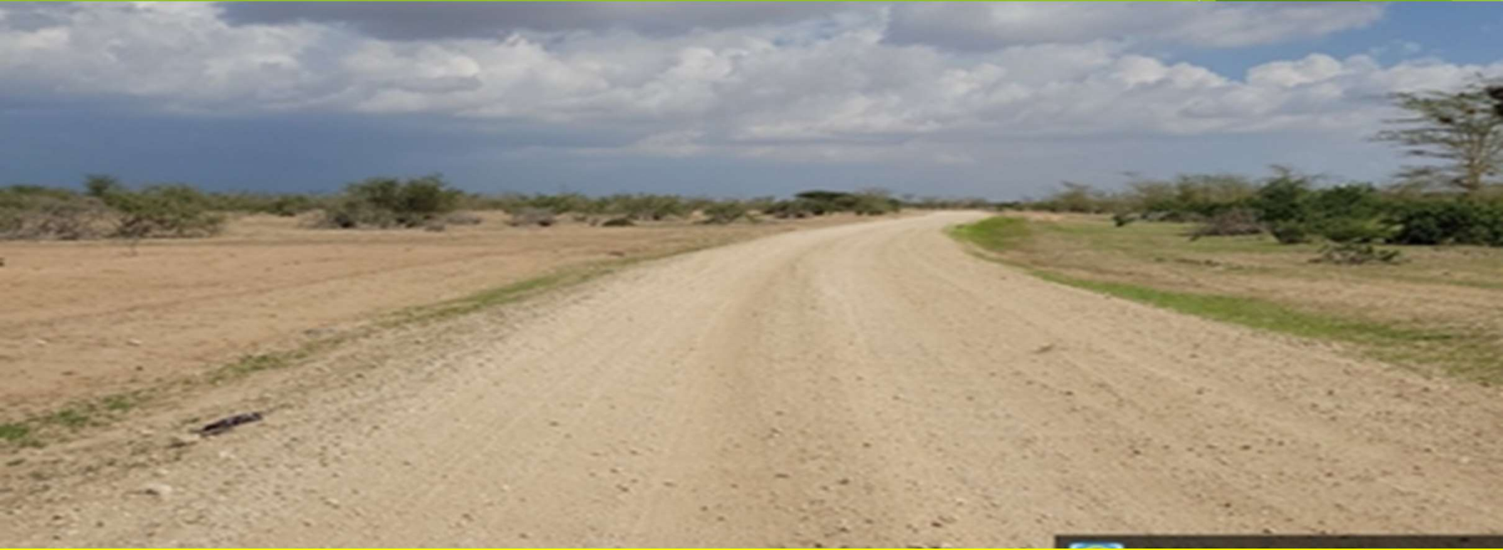
Section of road graveled in Kumahumato to Alikune, Dadaab