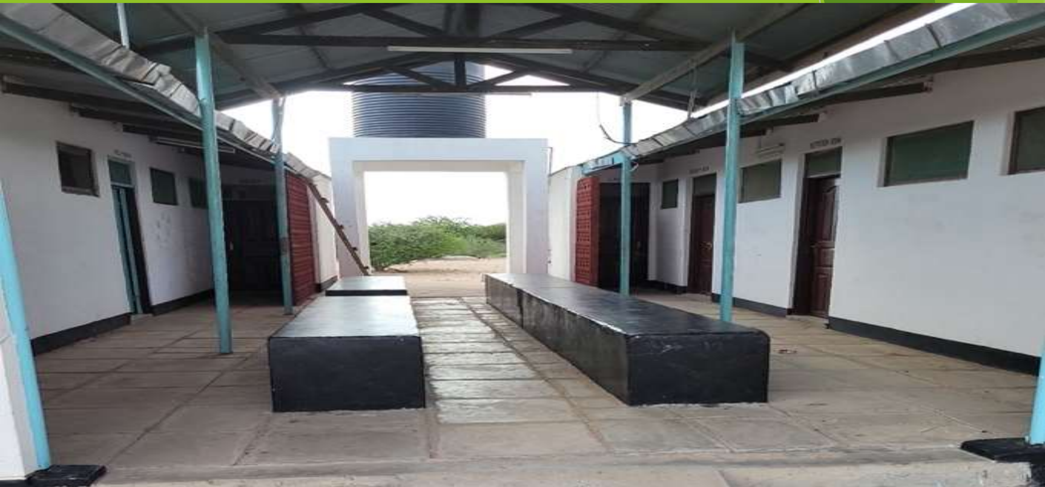
Renovation of Abakaile health centre