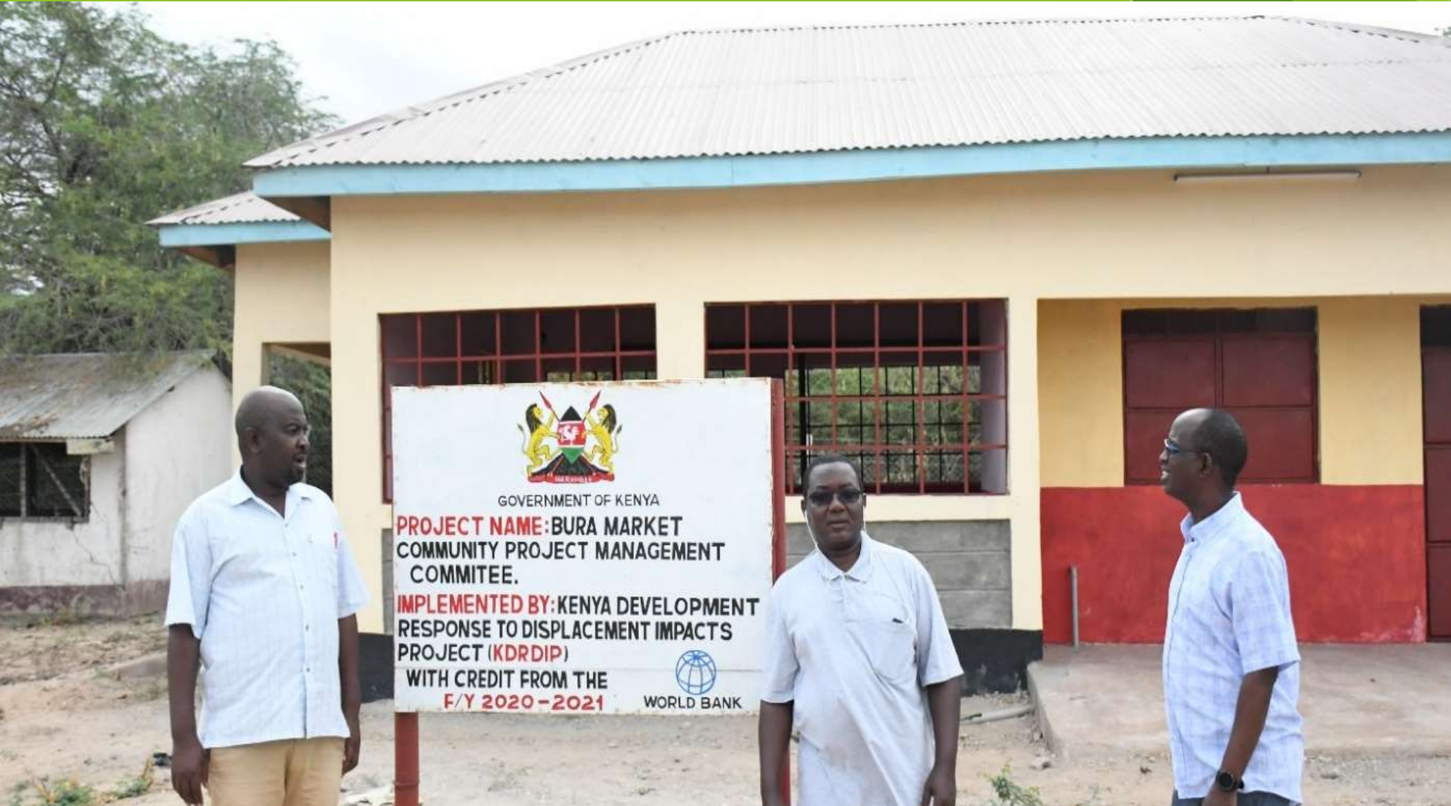
PIU team monitoring completed construction of Bura slaughter house, Fafi Sub-county