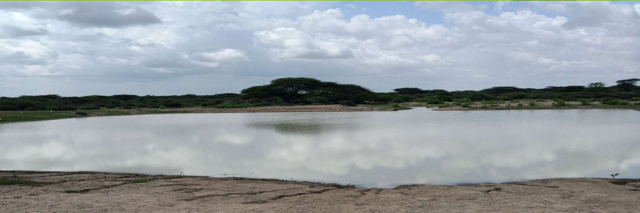
Desiltied water pan at Hagadera, Garissa