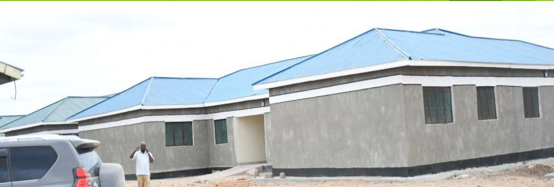
Completed construction and equipping of Fafi Sub-County Female and male wards in Bura