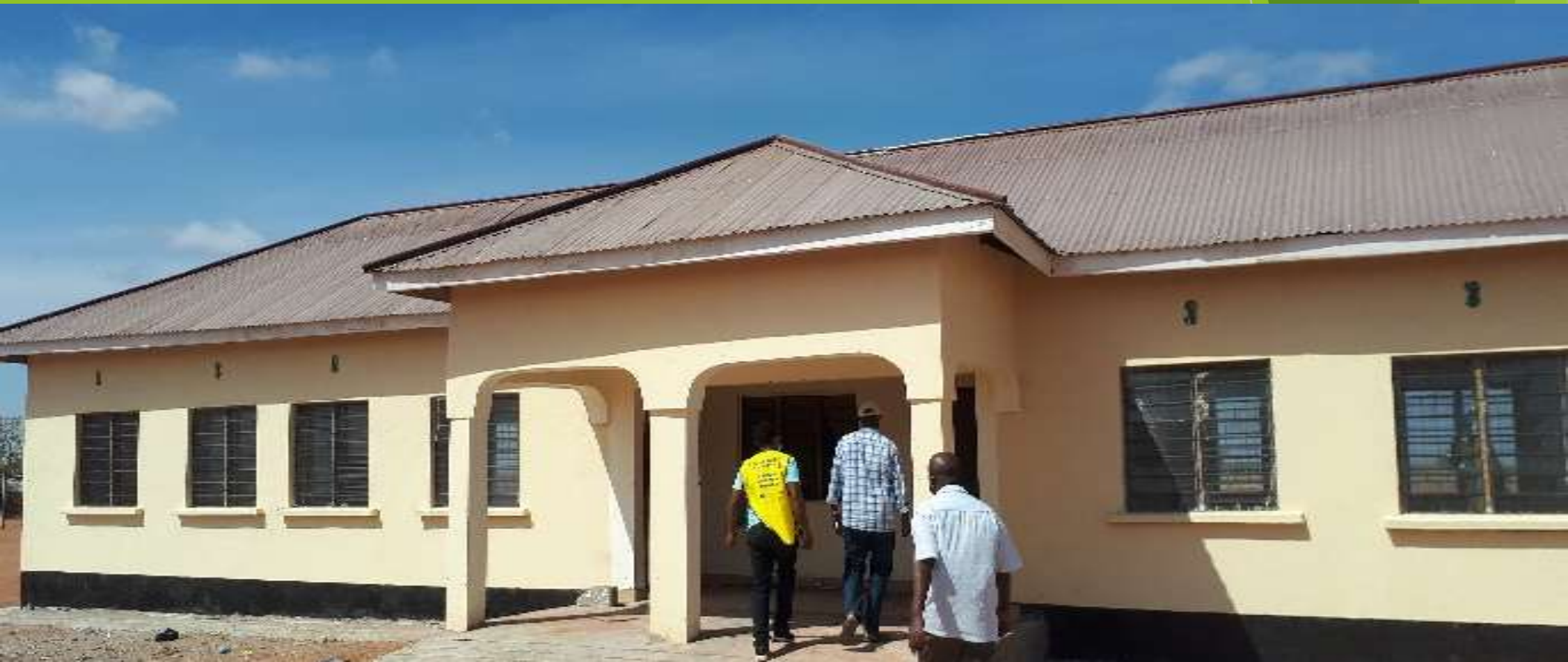
Constructed and equipped Dertu Male and Female Wards in Daadab