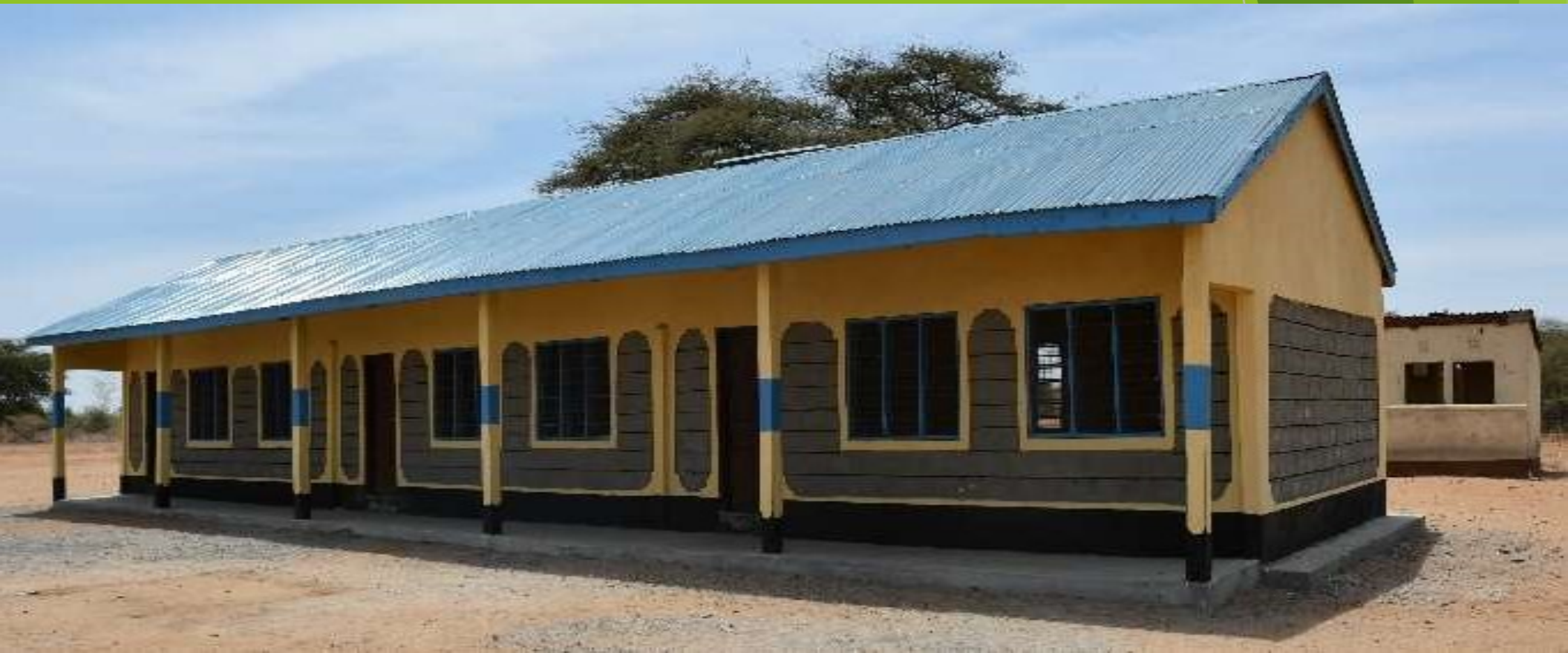
Three classrooms constructed at Gurufa Primary Lagdera