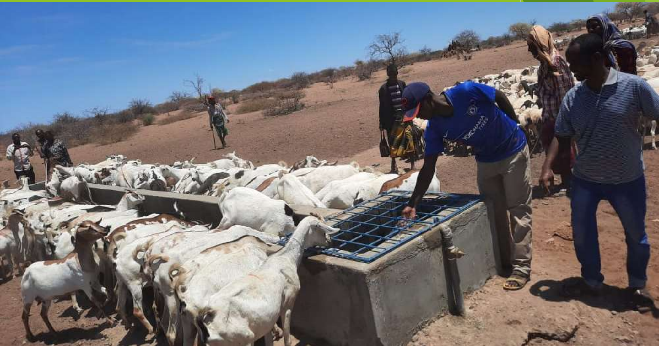
Completed Bahuri Water Troughs Sub-Project In Dadaab