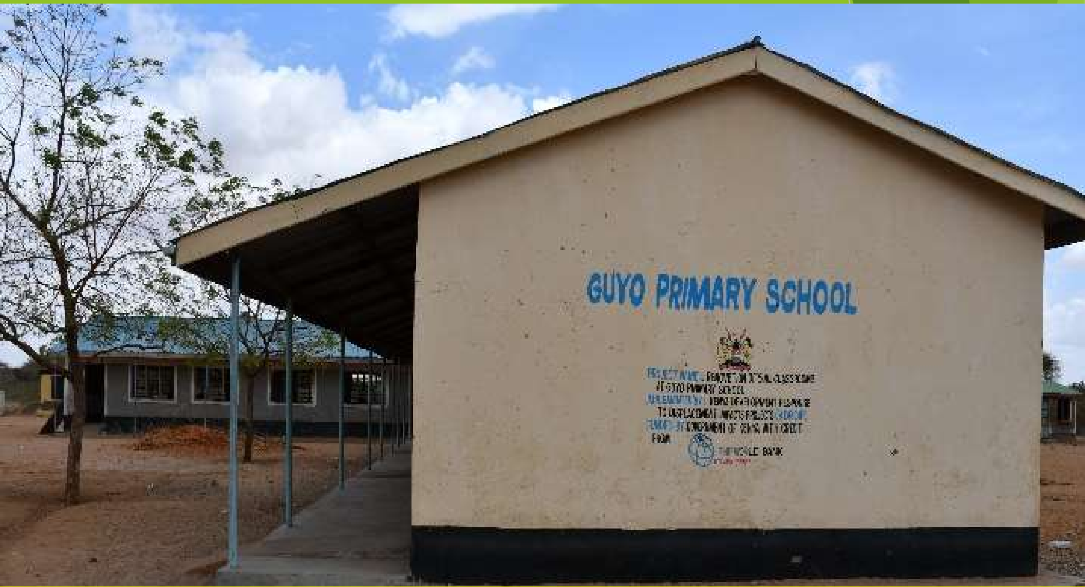
Renovation of 5 Classrooms in Guyo Primary School Fafi