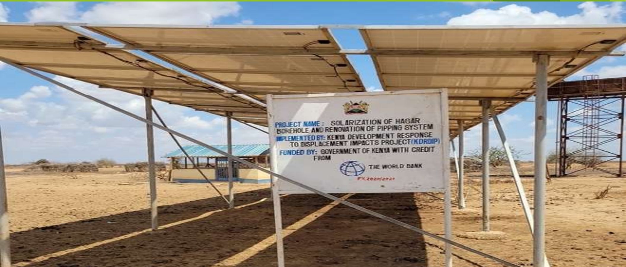
Solarization of Hagar borehole, Garissa