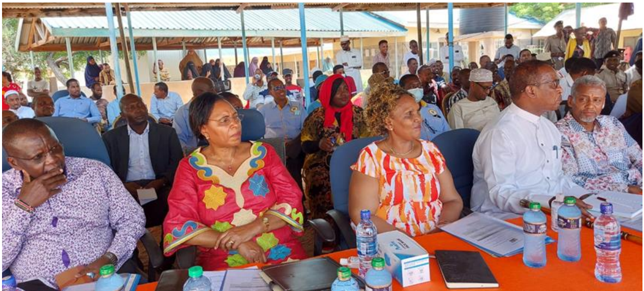
The Cabinet Secretary, Principal Secretary and the National Project Coordinator together with the Garissa local leadership following proceeding during a public baraza in Dadaab Sub County.