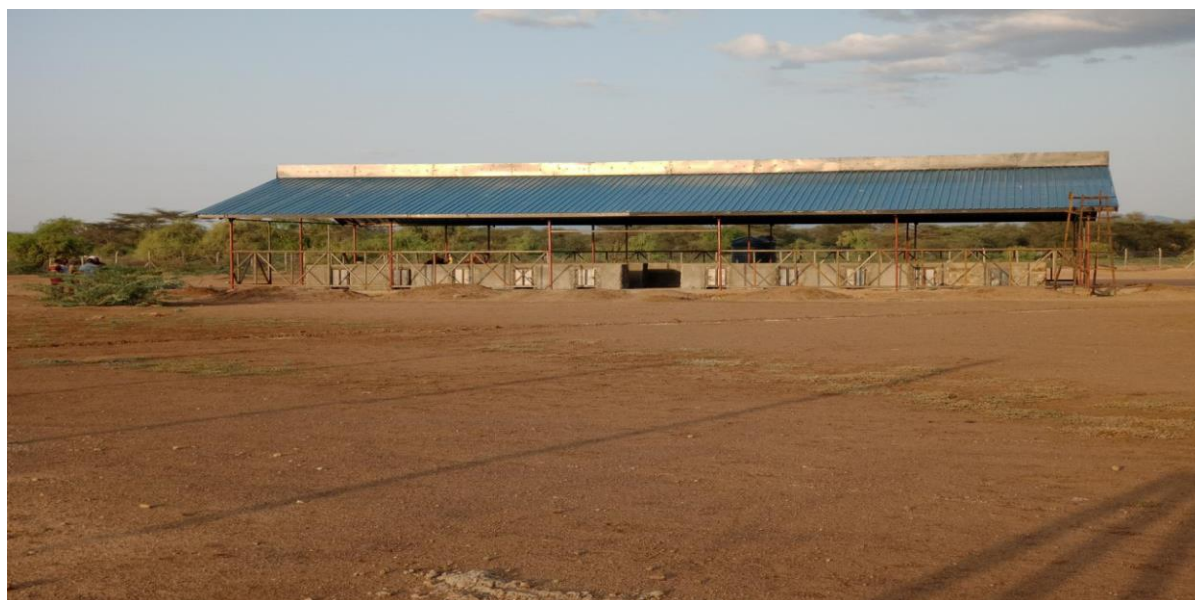
Ongoing construction of locher -edome market stalls in Lopur ward

This sector has implemented 5 sub-projects in total for 2020/2021 & 7 (seven) sub projects for 2021/2022. Most of the sub-projects were ongoing at percent 90% complete rate and commenced procurement for FY 2021/2022 activities.